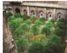
THE ORANGE TREE COURTYARD Ben Basso, 12th CENTURY.