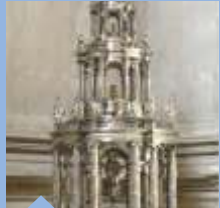
THE ARFE MONSTRANCE. Juan de Arfe, 18th CENTURY. Main Vestry.