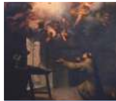
ST. ANTHONY'S CHAPEL Canvas of the vision of St. Anthony, B. E. Murillo, 17th CENTURY