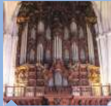
CATHEDRAL ORGANS. Duque Cornejo, 18th CENTURY.