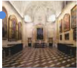
VESTRY OF THE CHALICES. Martín de Gainza, 16th CENTURY.