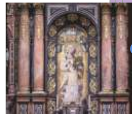
CHAPEL OF OUR LADY VIRGIN OF LA ANTIGUA Anonymous, 14th CENTURY